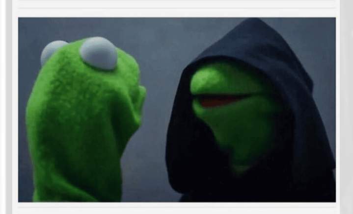
NIE TO MIE MAKE A NIEME, CHECK FACEBOOK 3 TIMES, EAT A SNACK, AND VAPE FIRST, &