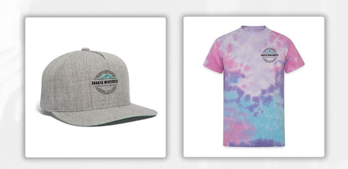
HATS • T-SHIRTS • SWEATSHIRTS • BEANIES & MORE Merchandise can only be purchased online www.shastawinterfest.com

Shasta Winterfest website will be updated with information as the schedule of events are finalized. Visit our website at www.shastawinterfest.com for more information & updates.