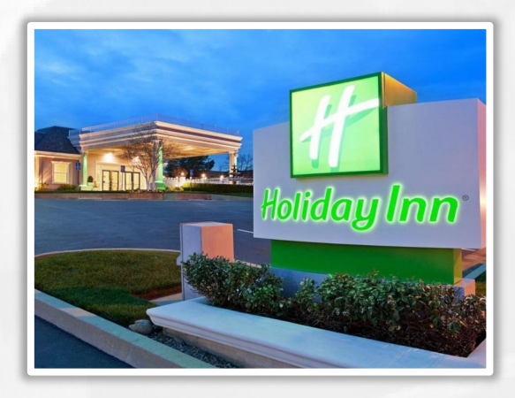
SHASTA WINTERFEST 2023 Holiday Inn, 1900 Hilltop Drive, Redding, CA 96002

Room reservation can be made online at www.ihg.com or by calling 1-844-201-1757 Discount code is AAW / $109.00 per night.