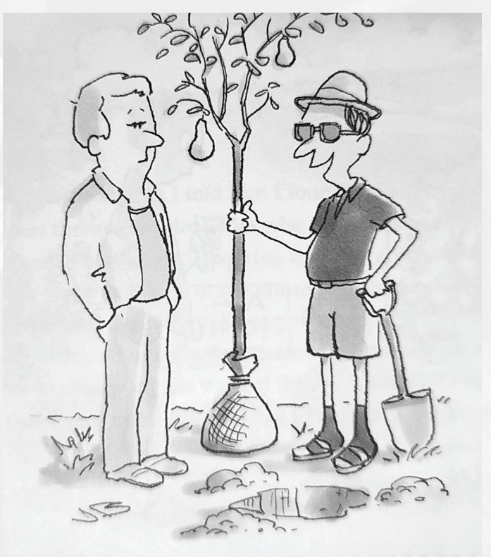
"It was my sponsor's idea. He suggested I grow a pear."